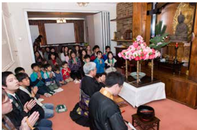
The Shrine of the Flower Festival