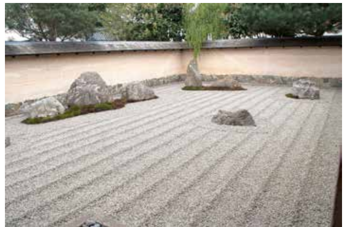
A view of the Zen Garden at Three Wheels