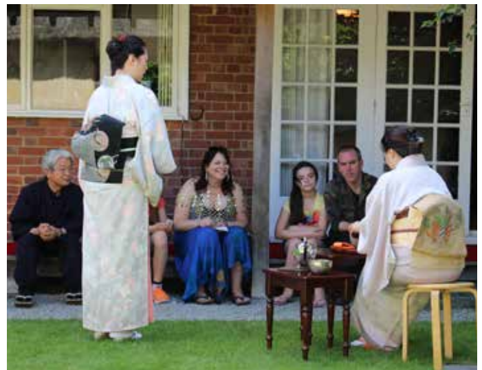
The Tea Ceremony