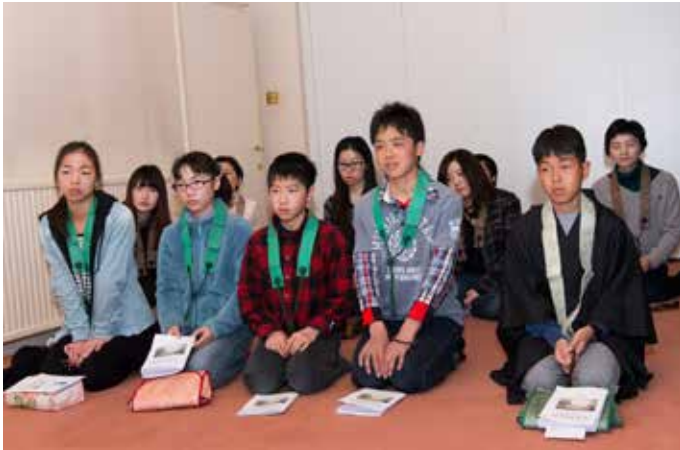
The Japanese students and their attendants