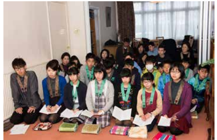
The Japanese Students and English ‘Teenagers’