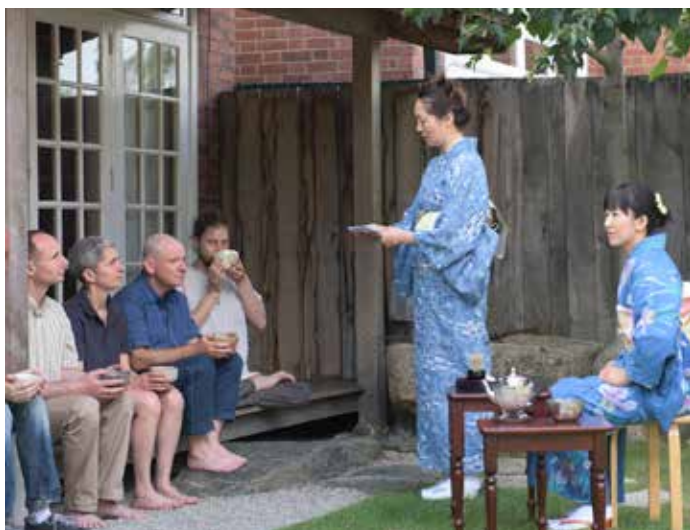
Initiation to the Tea Ceremony