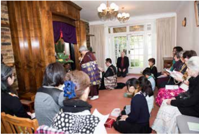
The Hoonko Otorikoshi Ceremony