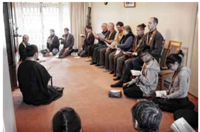
The Chanting lesson at the 15 th Shokai Retreat