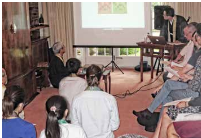
During the projection of the clip