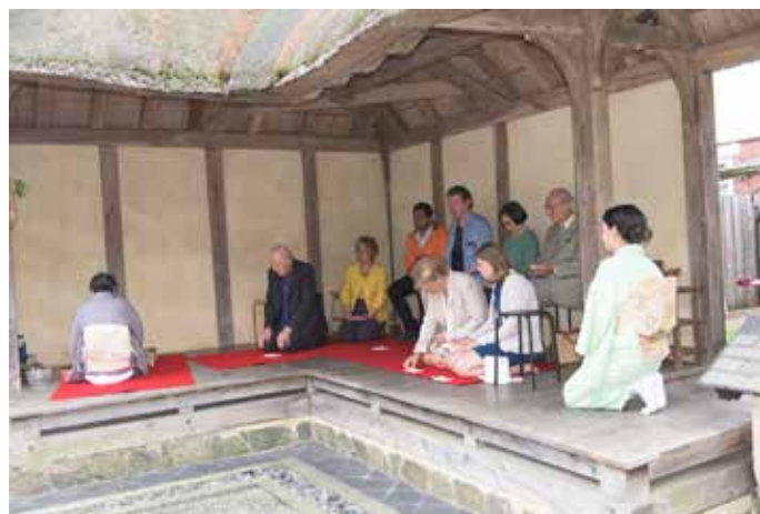
The Tea Ceremony in the Zen Garden