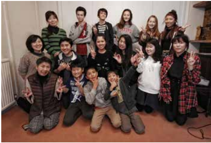
The Participants and Helpers