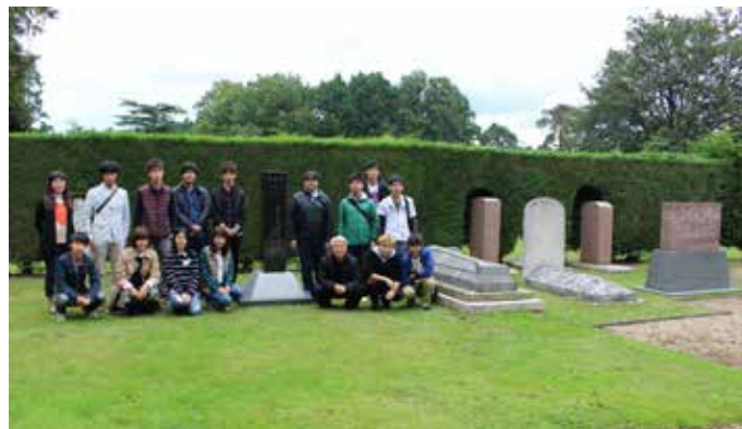
The Students visiting Brookwood Cemetery and cleaning the Graves.