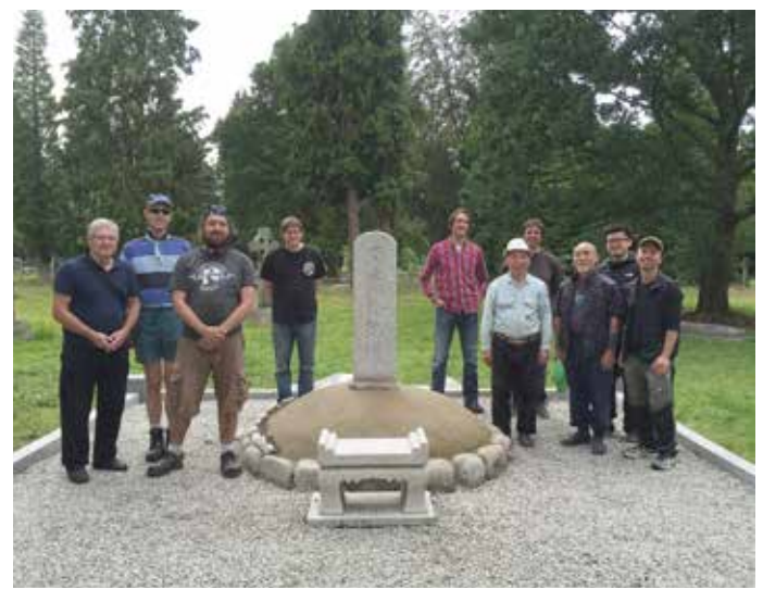
The Restoration Team

The grass mound of the Stupa, which had severely deteriorated due to the elements and the ravages of local wildlife, has now been replaced by a concrete dome inset with beautiful pebbles of various different colours and