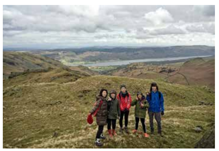
The students in Cumbria

Without having to say too much, we can imagine how greatly the students enjoyed the self-catering experience away from home, the beautiful countryside and the fun games and activities. The students were also given the opportunity to read the Sutra entitled "The Great Importance of What Has Been Done for Us by Our Parents" in the morning meetings and have a deep dialogue with their friends and teachers. These morning meetings gave the students an opportunity to think outside the box