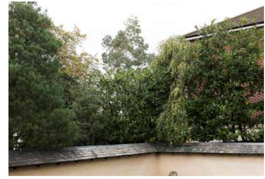
18. Trees in and beyond the Garden