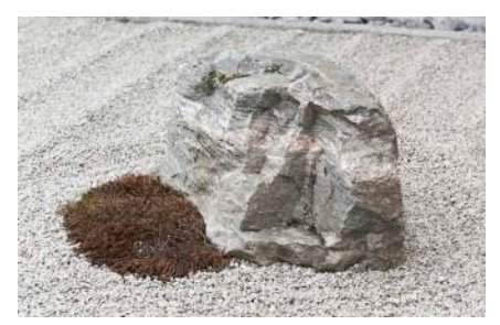
9. The rock on the far right

particular, unique pattern of the raked gravel (10).