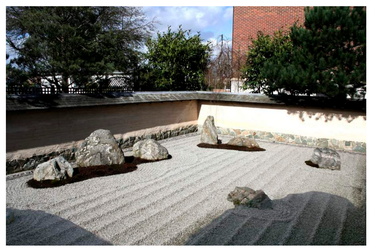
20. The garden from the ideal viewing point

Most people tend to think in terms of solids, rather than of the emptiness between them, and that way of thinking leads to disaster in many so-called Zen gardens. The starting point must always be empty space and the rocks are simply spaces within a space, a concept which, expressed in the form of a waka , has for many years appeared on the Three Wheels website.