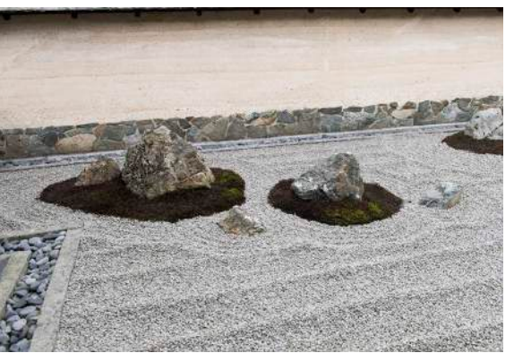
7. The opening group of five rocks

When that is seen, it then becomes impossible to miss the rock in the middle distance on the right, which points directly back to the centrepiece of the group of three.