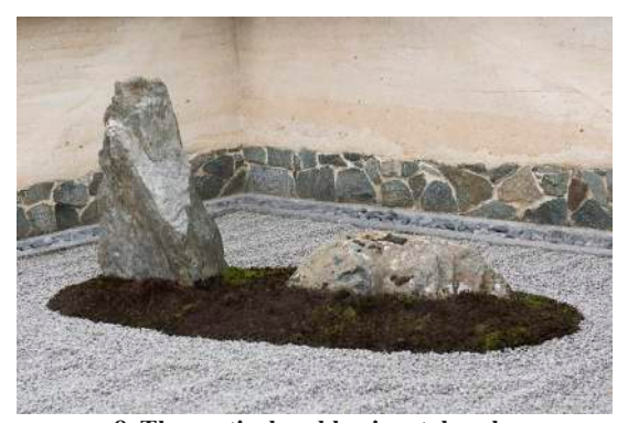
8. The vertical and horizontal rocks

It is a fundamental principle of good design in Japanese gardens in general, and in Zen gardens in particular, that all the rocks