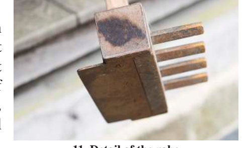
11. Detail of the rake

The rake used (11), which has a lead core in order to prevent it from jumping as it is pulled across the relatively coarse gravel, is an exact copy of one seen leaning against the wall of a shed at Ryoanji, the flat blade being used to create the widely spaced furrows representative of the vast, grey ocean rollers in the roaring forties of the southern oceans, while the square-sectioned prongs recreate the patterns formed by natural waves as they approach the shoreline of an island.