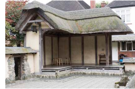
6. The meditation shelter