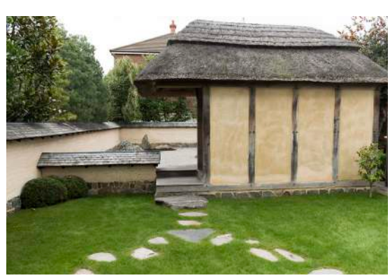
1. The entrance to the Zen Garden

Despite its obvious, all-important ancestry and innumerable points of contact, it is not in fact a copy of a Japanese Zen garden, but an attempt to get a feeling for the underlying principles and then, however wisely or unwisely, to extend them.