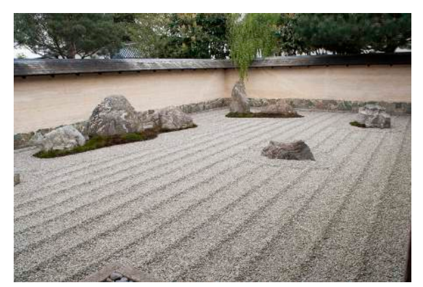
10. The raking pattern of the gravel

At Sanrin Shoja, the raking pattern was in fact the last decision to be taken after the gravel had finally been laid down, and is unusual in that it allows the observer to look straight down the main furrows instead of across them.