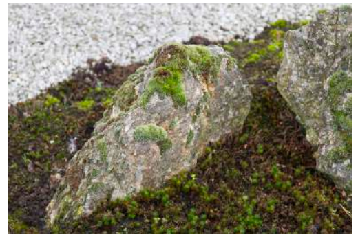
12. The foreground rock on the left

The final outcome is that, seen from the meditation platform, the perspectival convergence of the parallel lines of the large furrows greatly increases the apparent length of what is actually quite a small garden, while the way in which the long diagonal lines of sight to its far corners have been left completely clear of rocks further increases the resultant sense of space.