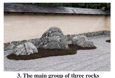
or the main group of three

As a result there is a wide range of textures and degrees of hardness, with different kinds of roughness and smoothness as well as variations of colour. Along with innumerable tones of brown and grey, together with pure whites, there are even shades of pink in the two rocks on the right, while several different colours may be