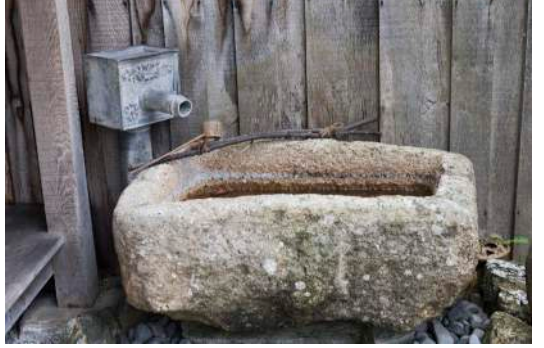
19. The chozubachi

As is true of every Japanese Zen garden, a wealth of symbolism is involved. This is not confined to the evocation, in this particular case, of ocean waves and mountainous, forest-covered islands, but is expressed in the very number of the twelve rocks which link it with the ancient twelve-tone Gagaku ceremonial music; with the twelve months of the year; with the signs of the zodiac and with the Buddhist concept of the twelve types of interdependent origination.