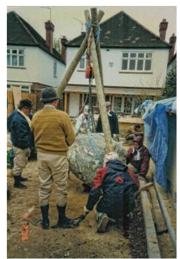
14. A wooden tripod in use

This age-old principle is not just a feature of Japanese design, but is also honoured in the West. The sculptures from high up in the pediment of the fifth-century BC Parthenon in Athens were never intended to be seen from the rear, and for over two thousand years they never were. But now, in the British Museum, it is possible to walk behind them and discover that the drapery on the backs of all the figures is as finely and as intricately carved as that on the front.