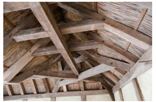
15. The structural timbers of the shelter

The cob of the enclosing wall, composed of a mixture of chalk, sand and lime, and capped by Cumbrian slate tiles, the greys and browns of which form an intimate link with the rocks and gravel of the garden