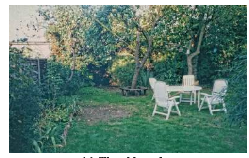
16. The old garden

This epitomizes the fact that all the making of the garden, including the clearing of the trees and tangled shrubbery of its original, rather rundown English precourser (16), and also the trenching of the entire space in order to remove every single remaining root and so avoid the