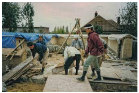
17. Japanese helpers at work

slightest danger of any shoots forcing their way up through the gravel, was done by hand.