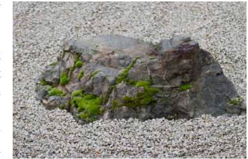
13 The lright foreground rock

There, the large central rock is one-third buried and the vertical rock at the end of the garden is half underground, while the rock in the right foreground (13), which was lying on its side close to a stream, is the most deceptive of all, as it is fully four-fifths underground. Moreover, since it widens to left and right and thickens as it goes down, it is so large and heavy that it required a cradle of steel scaffolding poles and eight strong men to carry it up to the nearby gravel track.