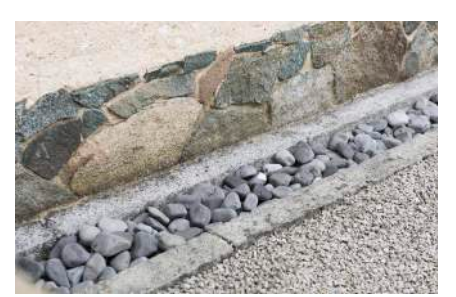
4 The base of the cob wall

As a result there is a wide range of textures and degrees of hardness, with different kinds of roughness and smoothness as well as variations of colour. Along with innumerable tones of brown and grey, together with pure whites, there are even shades of pink in the two rocks on the right, while several different colours may be