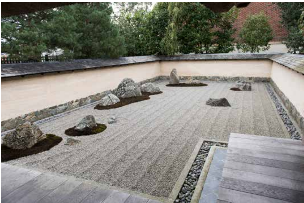
The Zen Garden

Nevertheless, with me giving instructions and all of us working together, our little group of friends managed to secure the stones with ropes and move their position or change the direction in which they faced.